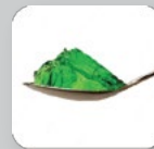
Plain Gelatin (without food additives)