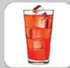
Powdered Drinks (like Kool-Aid™ & Crystal Light™)