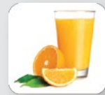
Orange Juice (or any food with pulp)