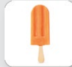
Popsicles (no pulp, no milk)