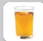
Apple Juice (pulp-free)