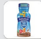
Liquid Nutritional Supplements (like Pediasure™)