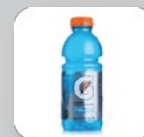
Sports Drinks (like Gatorade™)