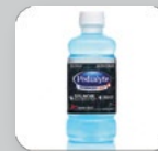
Electrolyte Solution (such as Pedialyte™)

These rules are in place to make sure your child's stomach is empty during the procedure. This lowers the risk of serious problems while they are under anesthesia.